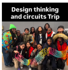
Design thinking and circuits Trip

build and test working circuits. Our 6 th graders are looking forward to the next session.